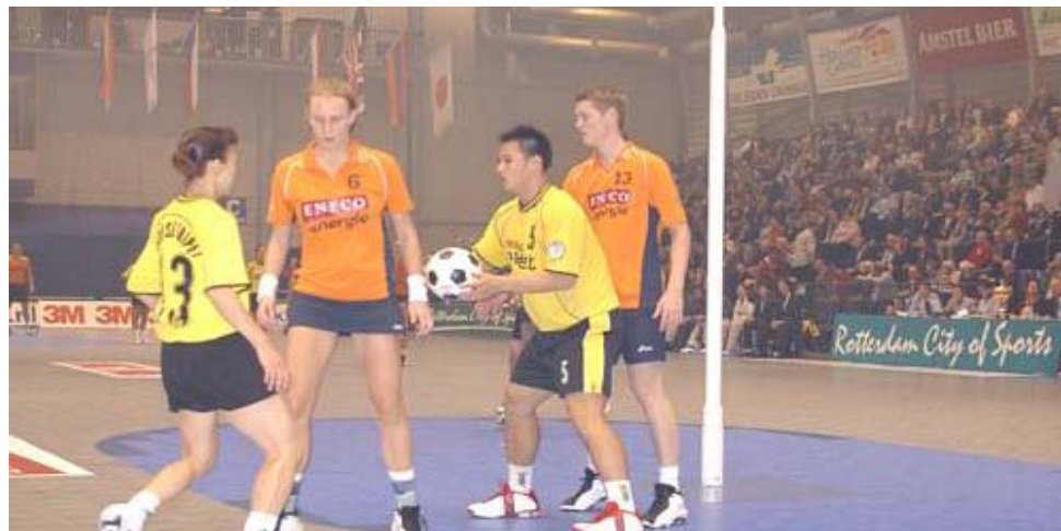
Netherlands – Chinese Taipei.